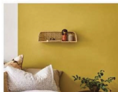
Clean Smooth Walls