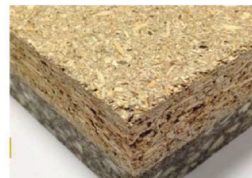
MDF | Chipboard

All wall and furniture coverings must be applied to a clean and dry surface which does not contain any 'stain repellent technology' including brands: 'Teflon & Dulux Trade Diamond Paint' as the resins may have a chemical reaction and nullify the adhesive. Please use standard trade matte emulsion and apply three weeks prior to installation date. Note if the wall has previously had stain repellent technology this needs to be removed with sandpaper before you apply your vinyl.